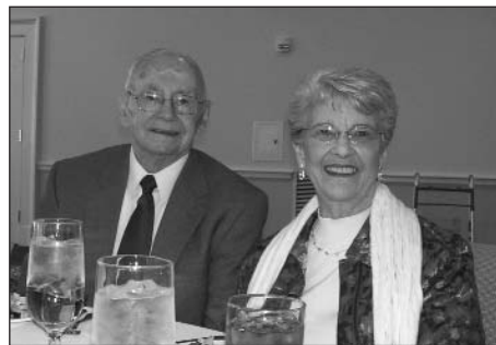
Our Senior Adults, their family members and friends celebrated Valentine's Day with a luncheon.