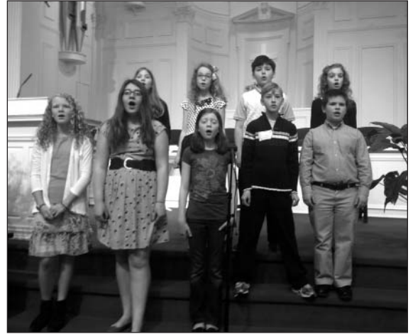
ABOVE: Members of the Second-Ponce Singers help lead in worship during a recent 11 a.m. service. BELOW: Children and their parents spent an evening bowling at Midtown Bowl in late February.