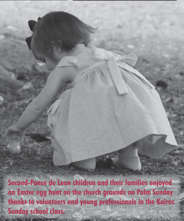
Second-Ponce de Leon children and their families enjoyed an Easter egg hunt on the church grounds on Palm Sunday thanks to volunteers and young professionals in the Kairos Sunday school class.