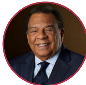
AMBASSADOR ANDREW YOUNG